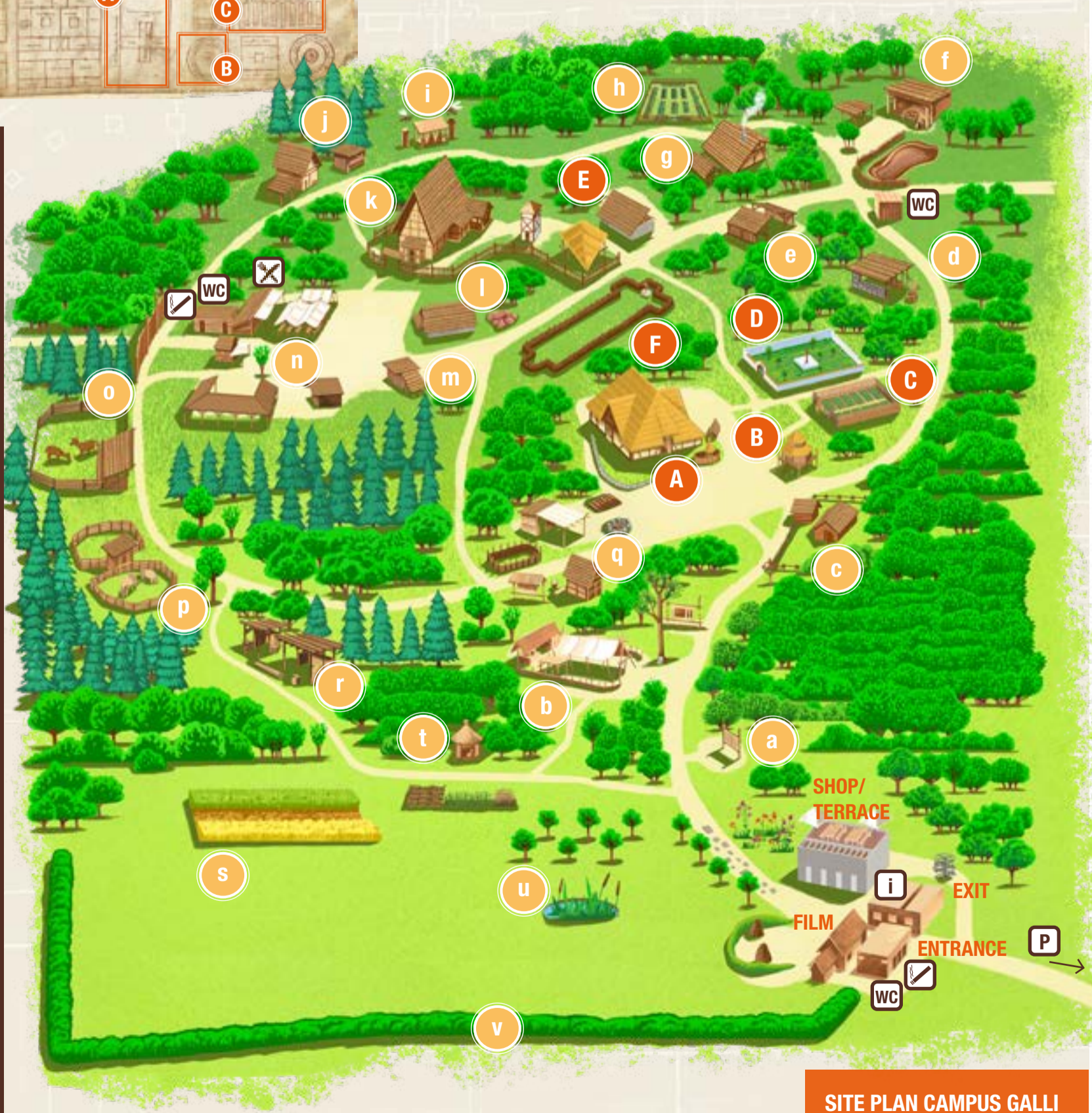
SITE PLAN CAMPUS GALLI